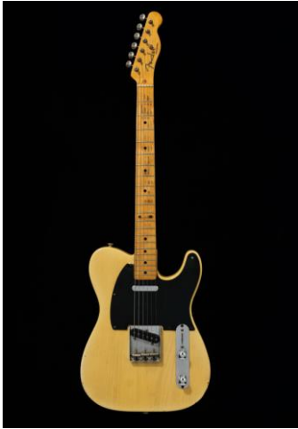
A Solid-Body Electric Guitar Telecaster, Serial number 6619 Fender Electric Instrument Company, Fullerton California, Circa 1954 length of back 15 3/4 inches Estimate: $12,000-18,000 Price Realized: $93,750